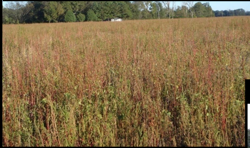
Pigweed Infestation 2009

Arkansas grower Sid Fogg faced the challenge of glyphosate-resistant pigweed head-on in 2009, spending about $50/A on herbicides without the ability to fully control the weeds.