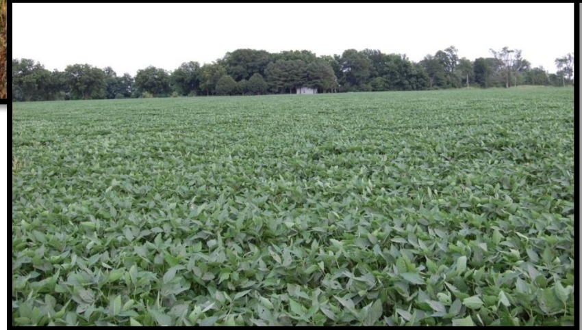
Pigweed Control 2010

Arkansas grower Sid Fogg faced the challenge of glyphosate-resistant pigweed head-on in 2009, spending about $50/A on herbicides without the ability to fully control the weeds.